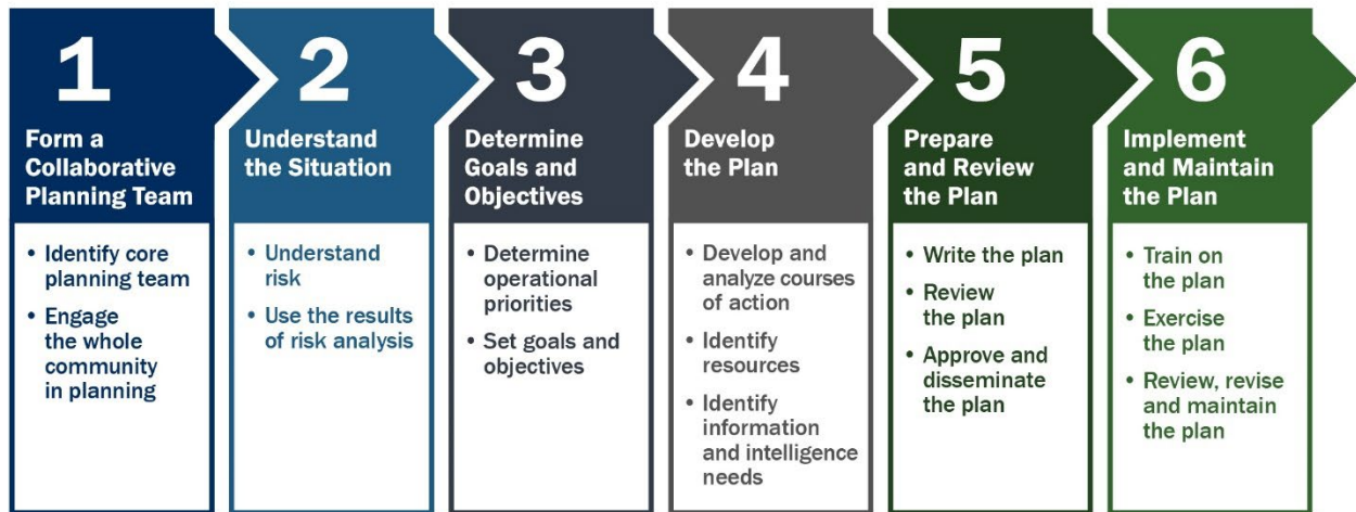
Figure 3. CPG 101 Emergency Operations Six-Step Planning Process

When preparing for cyber incidents, careful planning and collaboration are necessary to ensure a holistic and effective response. Using the six-step planning process detailed in CPG 101: Developing and Maintaining Emergency Operations Plans and shown in Figure 4, the planning team may develop a comprehensive and realistic plan or annex with purposeful involvement from all key stakeholders.